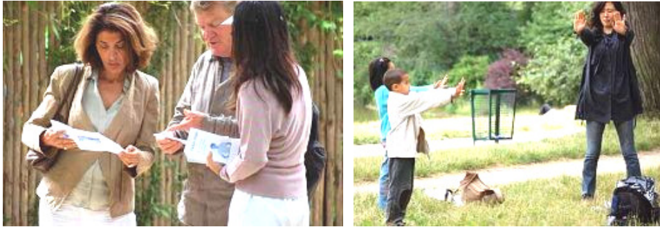
A couple carefully listens to an introduction to Falun Gong. Two children learn the Falun Gong exercises.

(Clearwisdom.net) June 24, 2007, was the annual Qigong Day in France. A variety of qigong groups gathered in Vincennes Park to teach qigong. Falun Dafa joined the event and practitioners taught the exercises for free. Several Falun Gong practitioners did the exercises and distributed Falun Gong fliers. Many people asked for information about this peaceful exercise practice. Some learned the exercises and did them together with the practitioners.